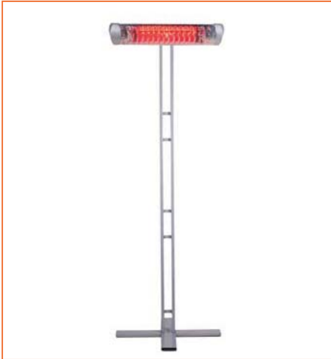
TOTEM with lamp 1200W.