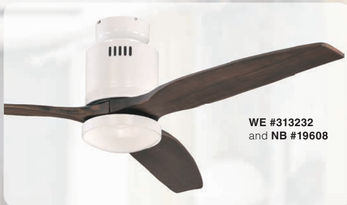
WE #313232 and NB #19608