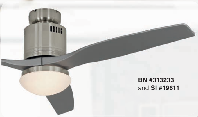
BN #313233 and SI #19611