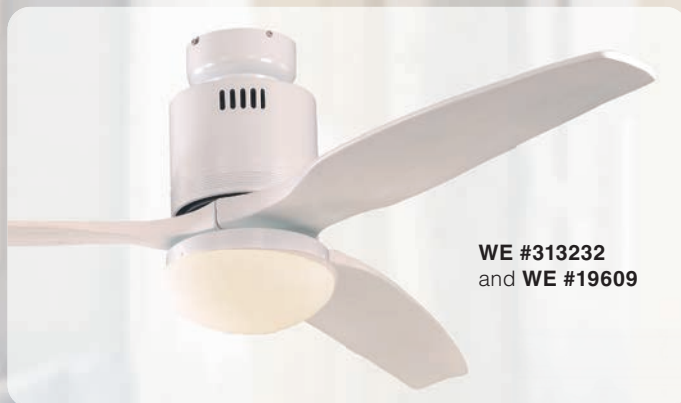
WE #313232 and WE #19609

Downrods for use of Aerodynamix ceiling fans in high ceilinged rooms or on sloped ceilings up to 28°. Available in 60 cm and 120 cm length. (can be shortened to any length).