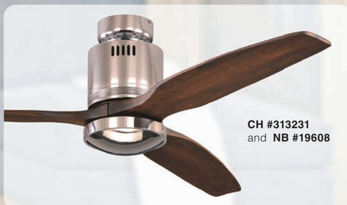
CH #313231 and NB #19608