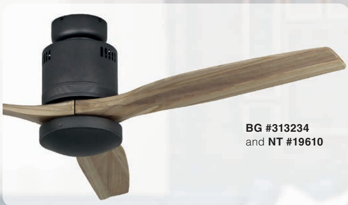
BG #313234 and NT #19610