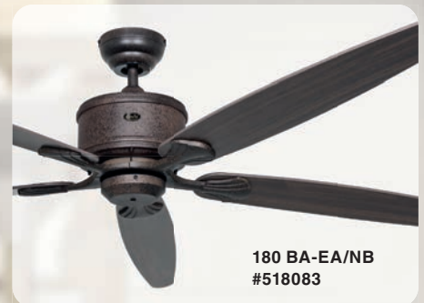
180 BA-EA/NB #518083