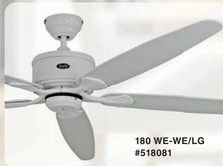
180 WE-WE/LG #518081