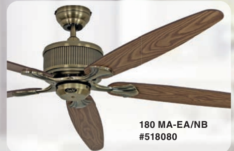
180 MA-EA/NB #518080