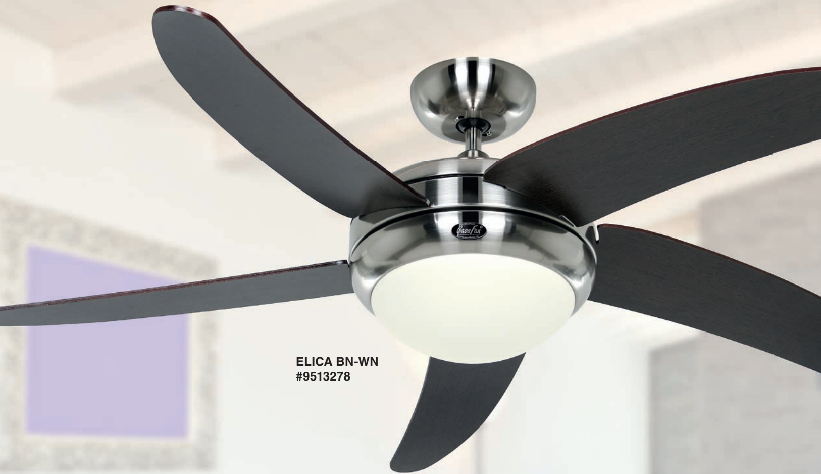
ELICA BN-WN #9513278